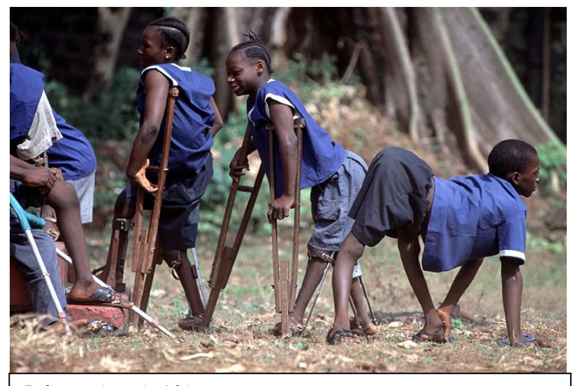
Polio survivors in Africa.

Poliomyelitis (polio) is a crippling and potentially fatal disease that still threatens children in parts of the world. The poliovirus invades the nervous system and can cause paralysis in a matter of hours. It can strike at any age but mainly affects children under five. Over 1,000 children per day were contracting polio in 1985.